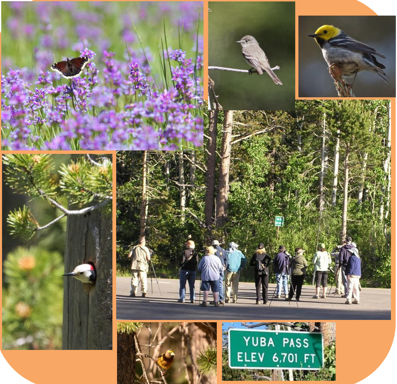
The meadow at Yuba Pass was in full bloom with many active butterflies including this Mourning Cloak – Brooke Miller / male Hermit Warbler – Brooke Miller