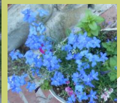
Moments after arriving at the Bassett's Burn the group enjoyed a foraging female Black-backed Woodpecker / Our target woodpecker Singing Chipping Sparrow / The "Birdaloo" caught the attention of many this weekend: they think it a little crazy, but they also thinks it's great The Butte's Resort in Sierra City is a beautiful getaway with beautiful flowers / The group enjoying dinner at the Mountain Creek Restaurant