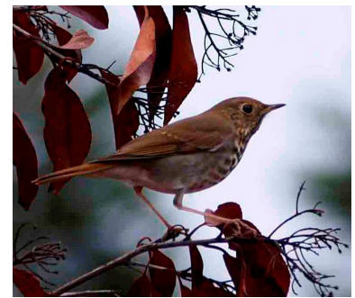
Hermit Thrush checking us out on Richmond