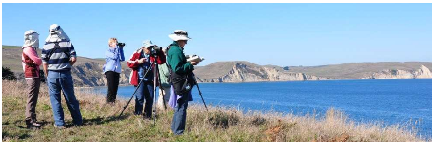
One of three Great Horned Owls observed this day – View over the fish docks - How many birders does it take to jump a battery? - Fantastic view from Chimney Rocks and heading home over the Golden Gate Bridge