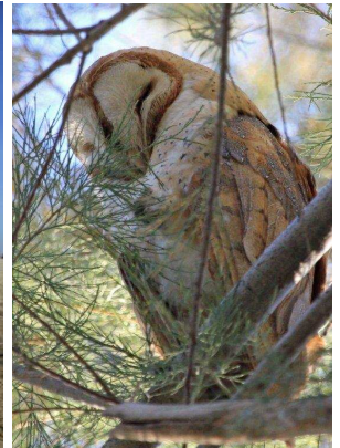
All images taken during our day – Mountain Bluebird – Ellen Bateman / Flock of Lark Sparrows – Nate Sanders / Juvenile Golden Eagle above road JI East of the Panoche Inn – Ellen Bateman / The group birding Panoche Valley – Lisa Myers / One of three Barn Owls sleeping at Mercey Hot Springs – Ellen Bateman