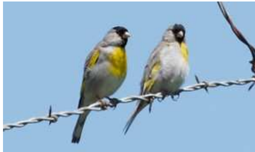
All pictures taken during our day – Ash Throated Flycatcher nest building, Grasshopper Sparrow & Lawrence’s Goldfinch. More pictures on page 2