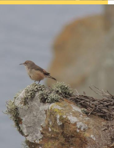
Images from Saturday – female American Kestrel hunting from the cliff, the group walking Devil's Slide and scanning the Pacific below / A favorite bird for our weekend, the Devil's Slide Rock Wren preening / The same Rock Wren looking over its domain