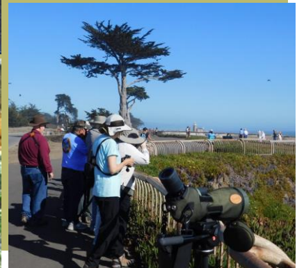
Sunday photos – Harbor Seal watching us / Group of Ruddy Ducks & a view of the harbor / Flags blowing in the wind at Pigeon Point Lighthouse / Our wonderful group photo taken by a gal walking by! A Santa Cruz Black Turnstone below on the rocks Our group in Santa Cruz enjoying the turnstone