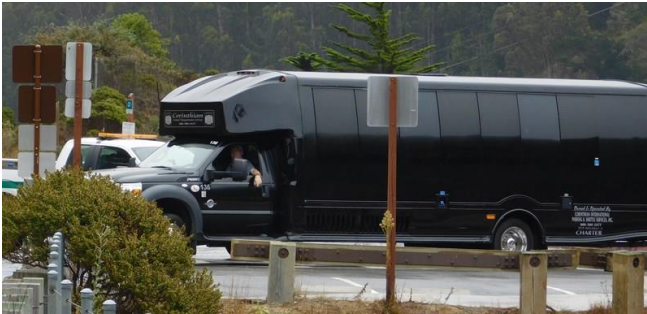
We can always count on our driver Tom from Corinthian Ground Transportation to be ready for us when we are ready to move on to our next location!