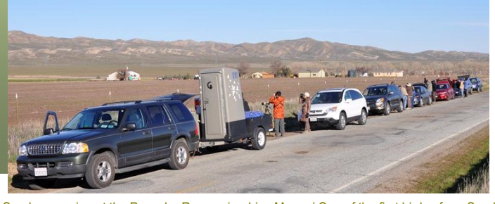
Images represent Sunday's birding and most were taken by trip participants - First stop Sunday morning at the Panoche Reservoir – Lisa Myers / One of the first birds of our Sunday, the Greater Roadrunner avoiding a Raven – Joe Diandrea / Our group shot of the weekend taken by Al Lowder / Owner Larry at the bar at the Panoche Inn – Joe Diandrea / A stop for Yellow Billed Magpies, tumbleweed and zucchini bread – Kjersti Leret / Stanford photographer Tom Grey provided this picture of a Mountain Plover, we saw this species, just not this close! The group parked along Panoche Road observing a scope view of the flock of the Mountain Plovers we worked hard to find – Lisa Myers