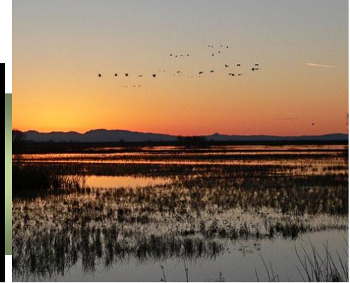
Images represent Saturday's birding - A very cooperative Sora came out under the viewing platform - Cadao Do / With no leaves on the trees its easier to find the roosting Great Homed Owls - Lisa Myers / A view from the platform at the Merced NWR, White Faced Ibis in the foreground with Ross's & Snow Geese behind - Cadao Do / The group watching and listening to the interaction between a pair of Great Horned Owls - Lisa Myers / Merced NWR Sandhill Cranes at sunset - Tony Woo - More photos page 3