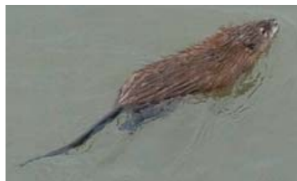
Photo credits - We never knew if smiling Mike was coming or going! The group looking for wintering Passerines at Caswell Memorial Park – Gary Pappani Red Shoulder Hawk with fish at Lodi Lake Park – Sonny Mencher Found fungi all weekend including this “Lion’s Mane” at Lodi Lake – Debbi Brusco Canvasback Ducks were all over Staten Island Road – Image provided by Tom Grey A flock of Western Bluebirds were the hi-light of one bathroom stop – Sonny Mencher A dog paddling Muskrat was swimming at Woodard Reservoir – Debbi Brusco