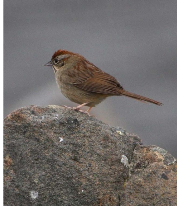
Rufous Crowned Sparrow above and hard working Red Breasted Sapsucker

Quick Overview – Watching the weather reports we all saw the storm coming, but a group of adventurous souls arrived with all their rain gear and ready to go regardless of the elements, and what a day we had! Once east of Gilroy and traveling through the country roads we realized that soaking wet birds create unique ID challenges. With characteristic feathers in disarray and the wet plumages now appearing much darker we had to leave some questionable birds off our list. We had wanted to walk some of the trails that make up the new Harvey Bear Ranch Park, but the rain had us doing most of our birding from the cars which was easy along Coyote Reservoir Road as it parallels the lake. It also makes it easy when no one else is in the park. We could stop anywhere we wanted and we were not in anyone's way – a birder's dream come true! Watching Violet Green Swallows by the hundreds reminded us all that spring is near. And at one stop we got four woodpecker species. Ending our day watching Bald Eagles grasp fish at the surface of the water was worth our getting all wet! And I'll not soon forget our close encounter with the dam's Rufous Crowned Sparrow. Since we started our day at the south entrance of the park we ended our day at the north entrance. It was here we listened to Western Meadowlarks and watched a Say's Phoebe. I thank everyone for being part of a most memorable day!